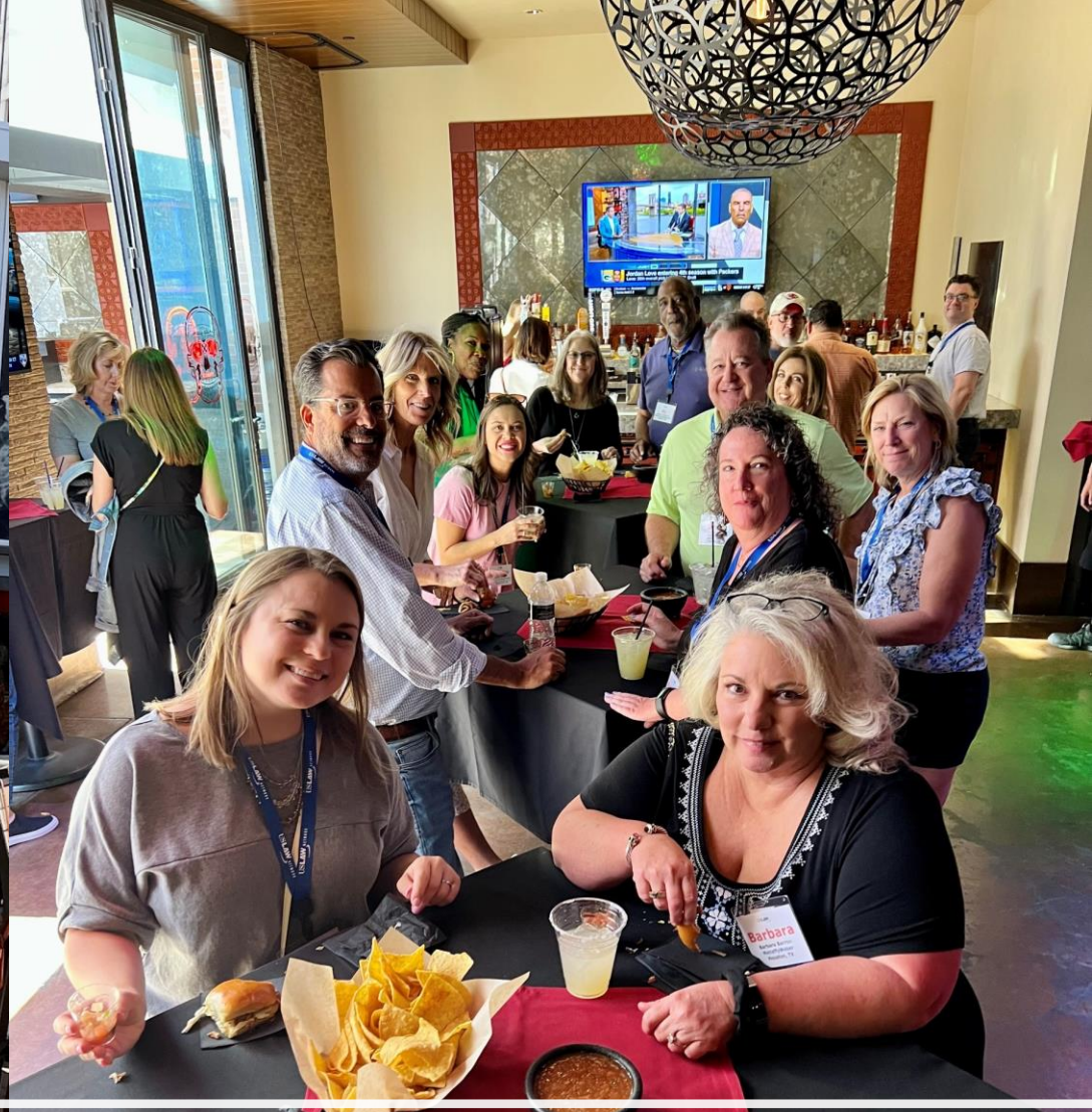
ACTIVITIES – LUNCH AT CHAYO